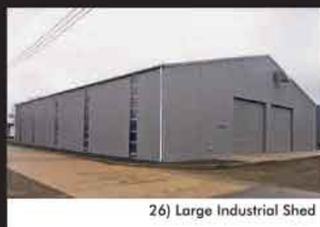
26) Large Industrial Shed