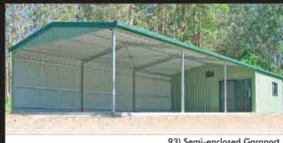
93) Semi-enclosed Garaport