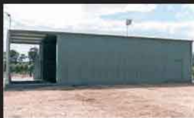
5) Large Farm Shed with Garaport