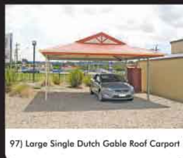
97) Large Single Dutch Gable Roof Carport