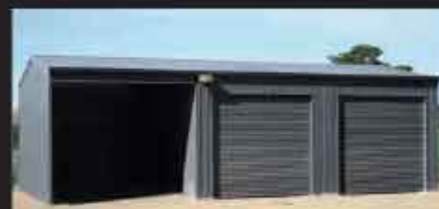
19) Farm Shed with One Open & Two Enclosed Bays