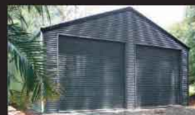
87) Double Garage with Horizontal Cladding