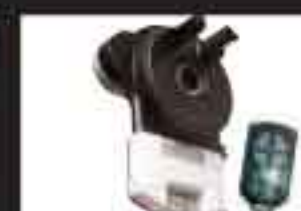
Auto Door Opener