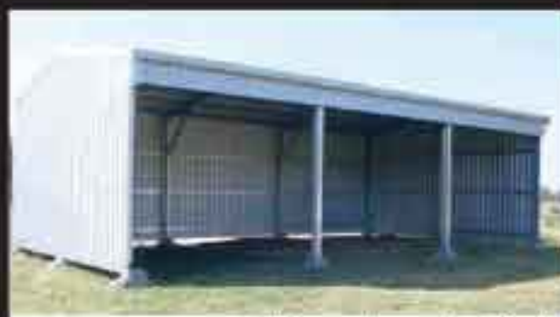
9) Open Three Bay Shed