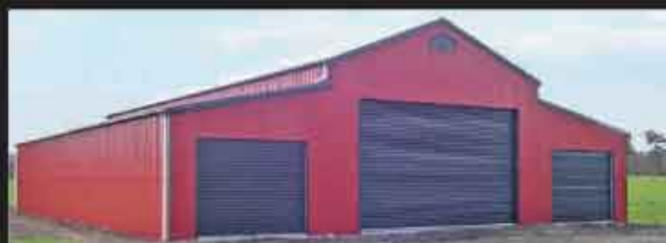
40) Large American Barn

You can easily personalise your barn with windows and glass sliding doors. We can even supply fly screens and security screens or window locks. To fully take advantage of the additional ceiling height, consider installing a mezzanine floor for use as storage or an additional workspace.