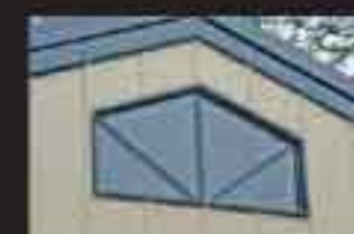
Barn Style Window