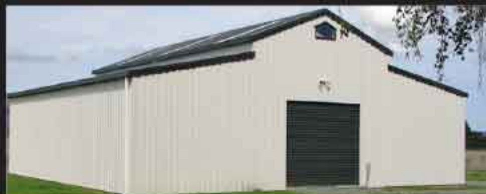
42) Large American Barn with One Roller Door