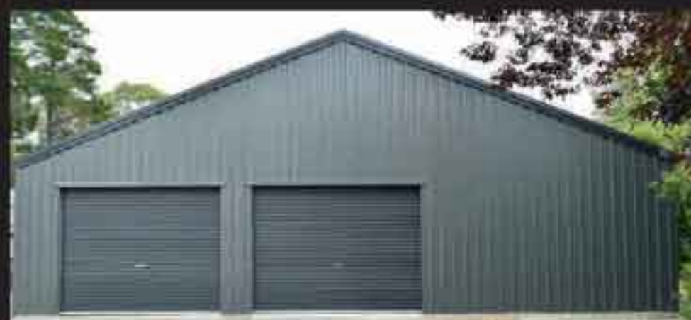
77) Large Garage & Workshop