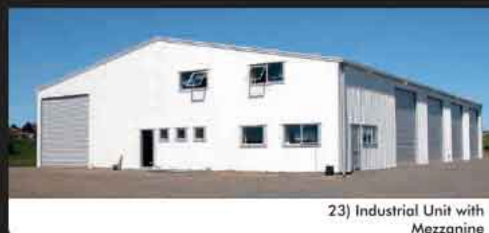
23) Industrial Unit with Mezzanine

Foundation systems can also be customised to suit your specific needs.