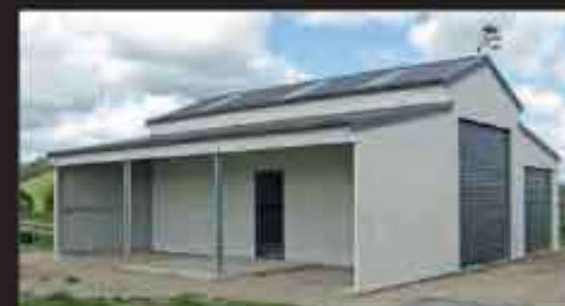
48) American Barn with Lean-to