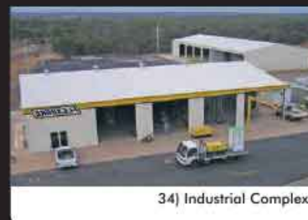
34) Industrial Complex