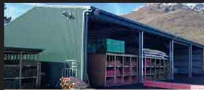
8) Open Four Bay Shed