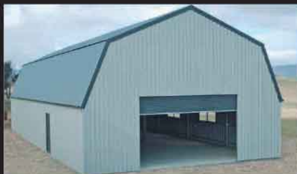
59) Large Industrial Quaker Barn

A stunning angled roof better matches modern looking homes. Mix and match horizontal and vertical cladding and component colours for more pizzazz!