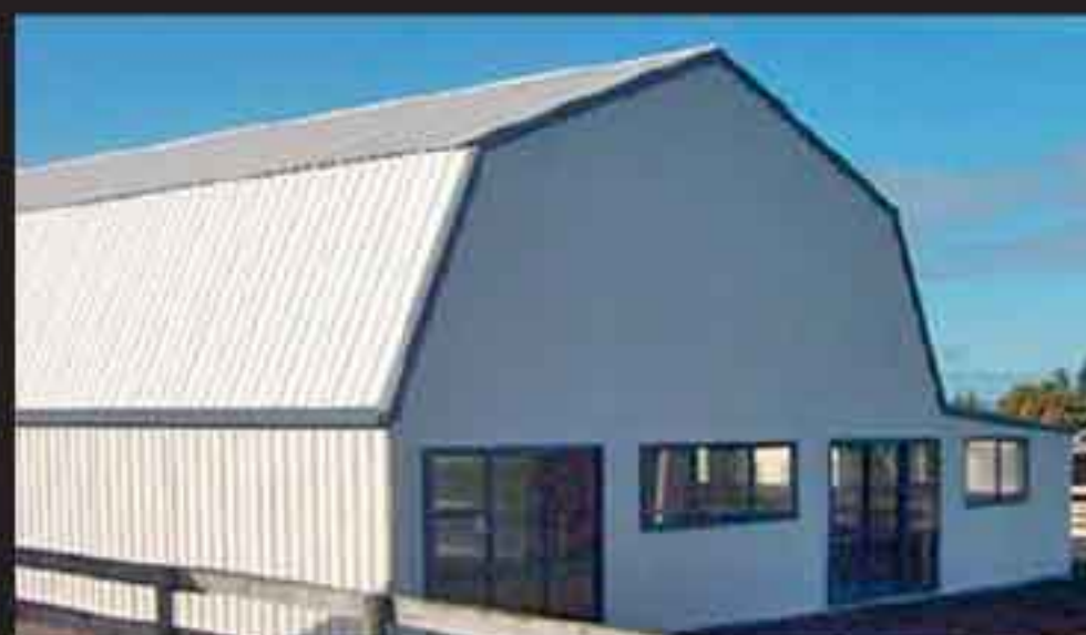
60) Quaker Barn with Closed-in Lean-to