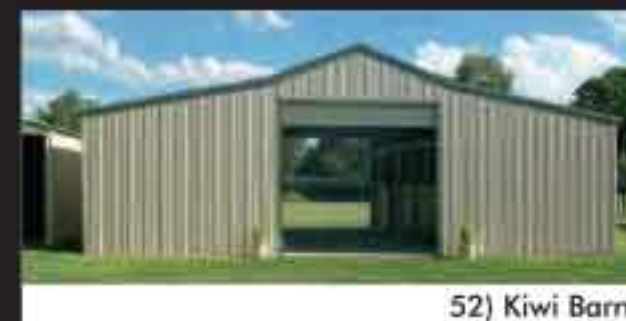
52) Kiwi Barn