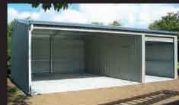
83) Open Bay Beam Over Shed & Garage