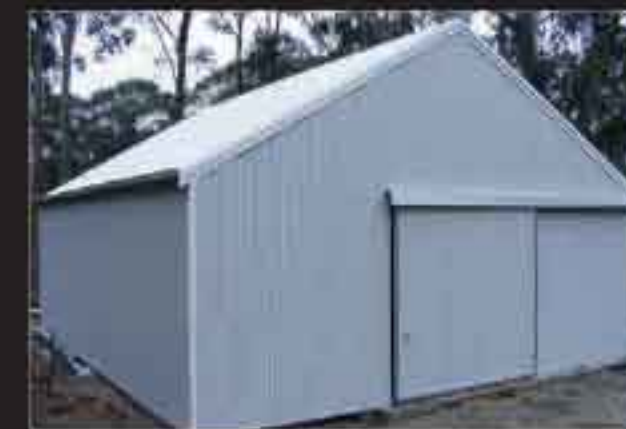
12) 30° Roof Pitch with Sliding Door