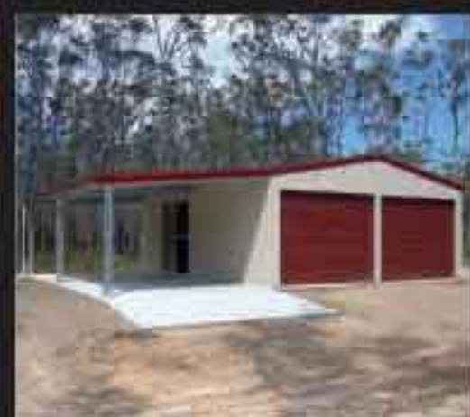
90) Double Garage with Lean-to