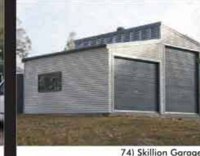
74) Skillion Garage with Lean-to