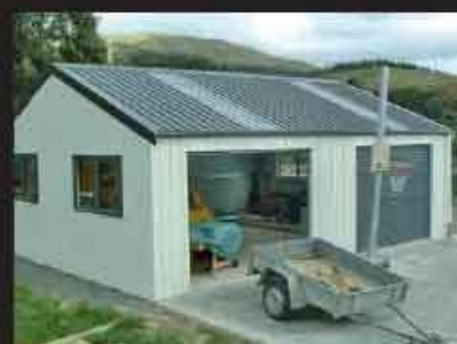
81) Home Workshop