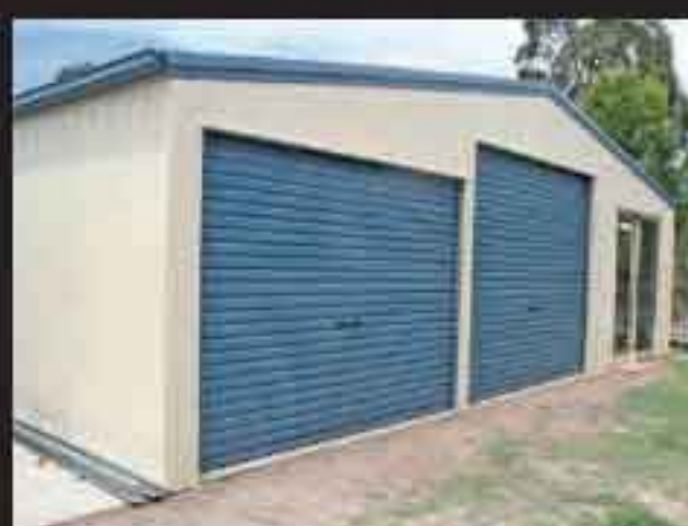
80) Triple Garage with Glass Sliding Door