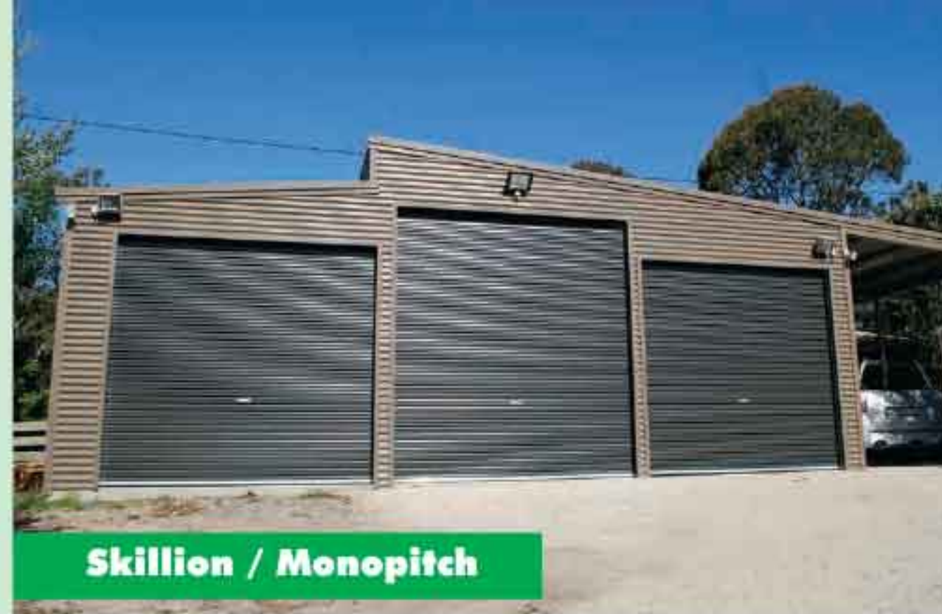
Skillion / Monopitch

These unique designs make the most of upstairs space making them a practical solution for that holiday block, studio apartment or alternative living arrangement. These are also widely used as double garages with massive storage capacity.