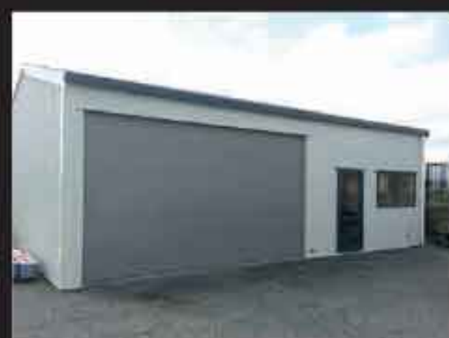
79) Garage & Workshop