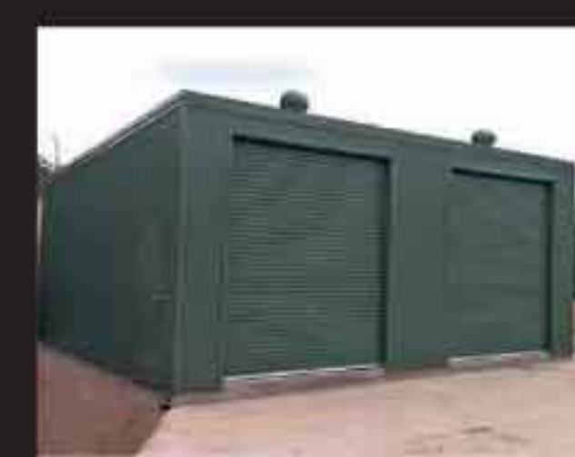
70) Skillion Garage