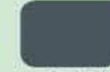
New Denim Blue