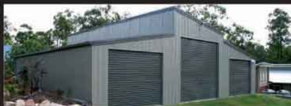
44) American Barn with Skillion Roof