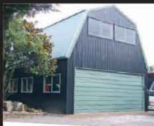
62) Quaker Barn with Vertical Cladding