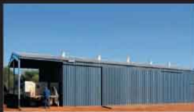
4) Large Farm Shed with Sliding Doors & Garaport