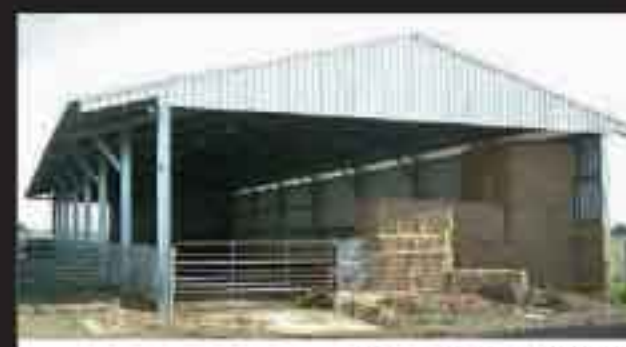
15) Large Hay Shed