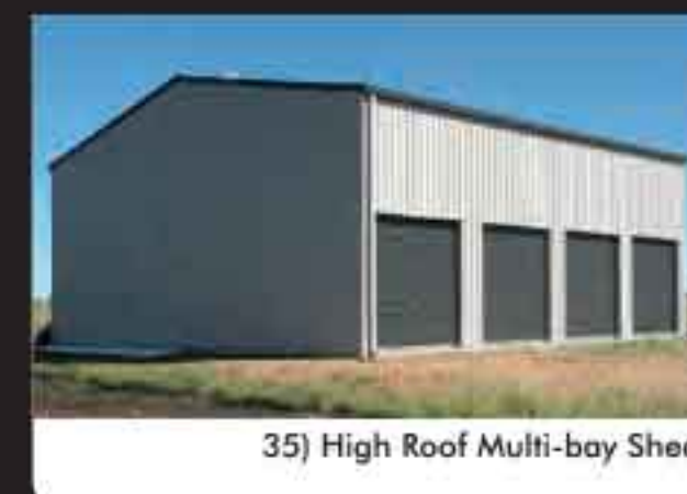
35) High Roof Multi-bay Shed