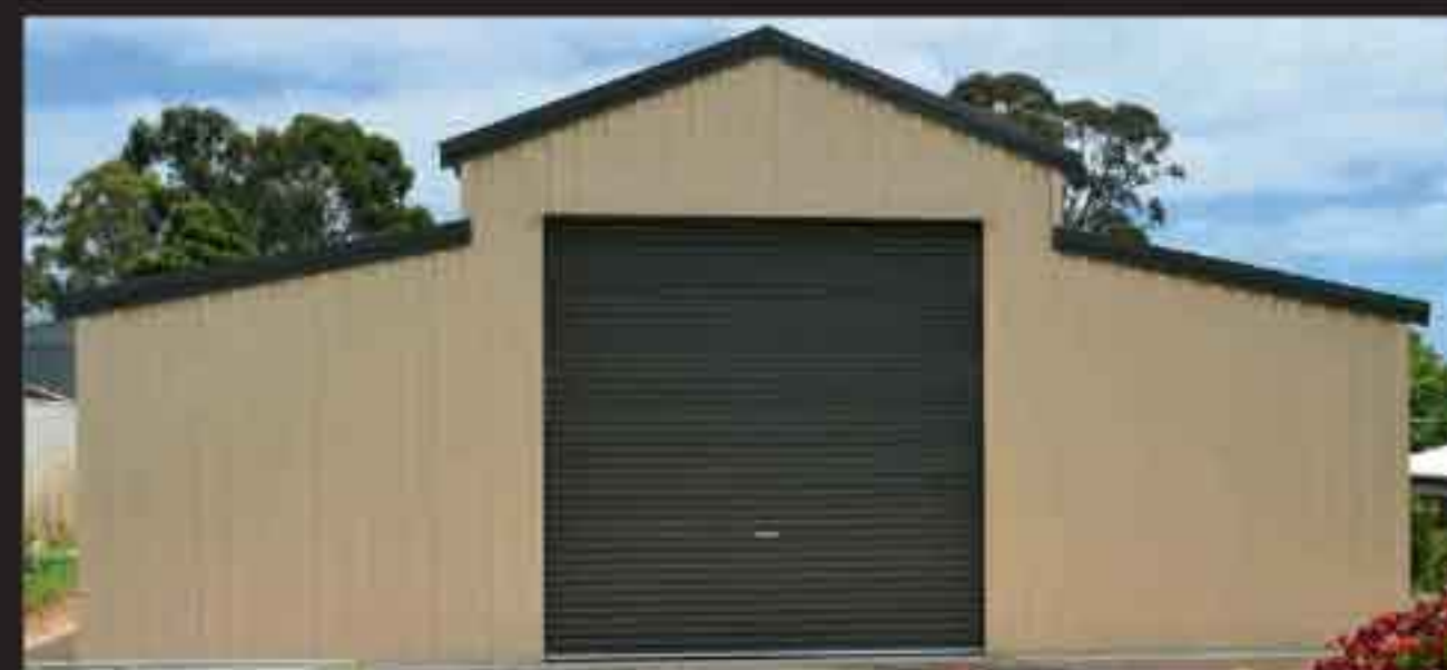
58) American Barn with One Roller Door