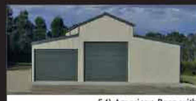
54) American Barn with Two Roller Doors