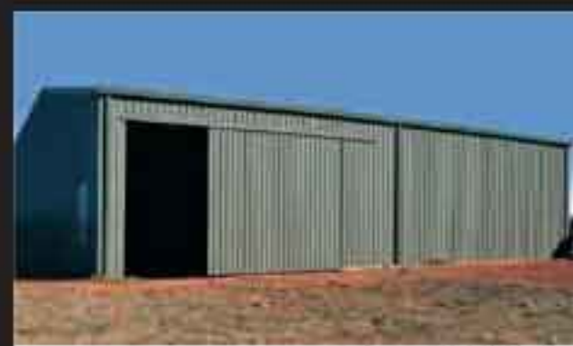
3) Farm Shed with Sliding Doors