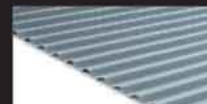
Metalcraft Corrugated 760mm Cover