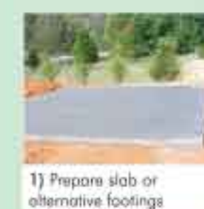
1) Prepare slab or alternative footings

For a more detailed guide, please visit www.fairdinkumsheds.co.nz/downloads