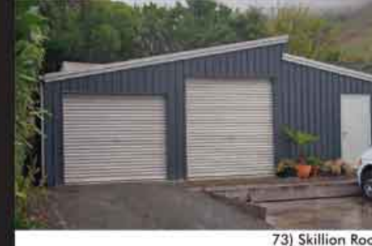
73) Skillion Roof