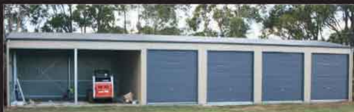
7) Farm Shed with Two Open & Four Enclosed Bay