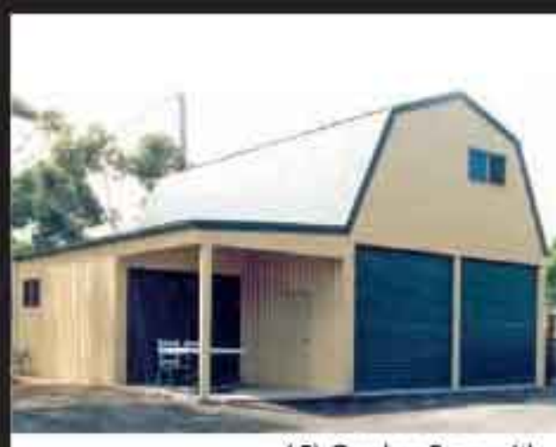
65) Quaker Barn with Annex