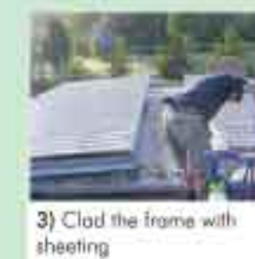
3) Clad the frame with sheeting