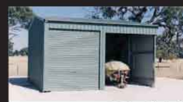
22) Farm Shed with One Open & One Enclosed Bay