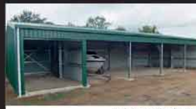
17) Farm Shed with Four Open & One Enclosed Bays