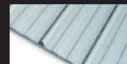
Metalcraft Metclad 850mm Cover