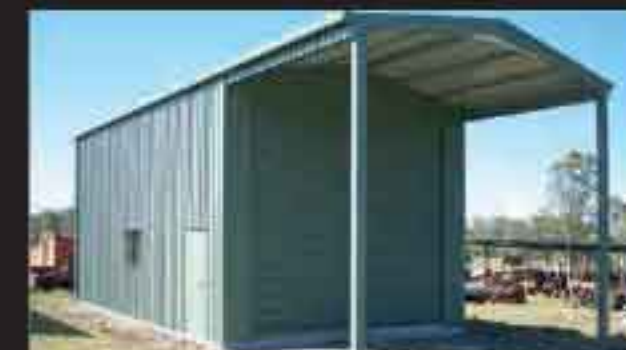
14) Tall Shed with Garaport