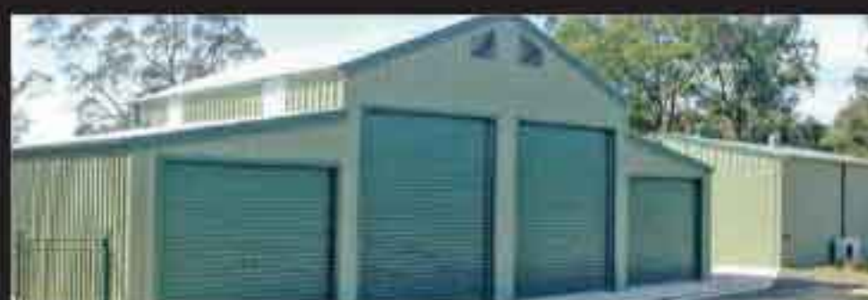
46) American Barn with Four Roller Doors