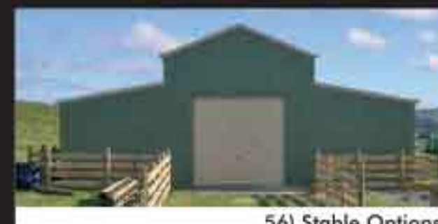
56) Stable Options