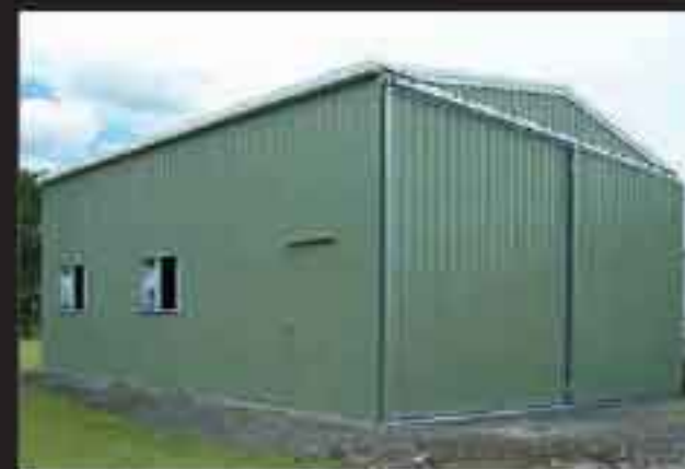
11) Tall Shed with Sliding Door