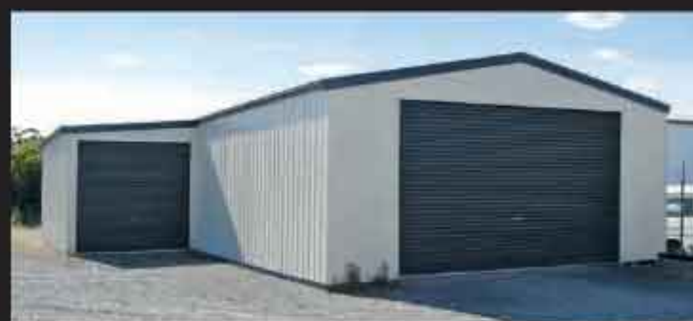
76) Large Shed with Enclosed Lean-to