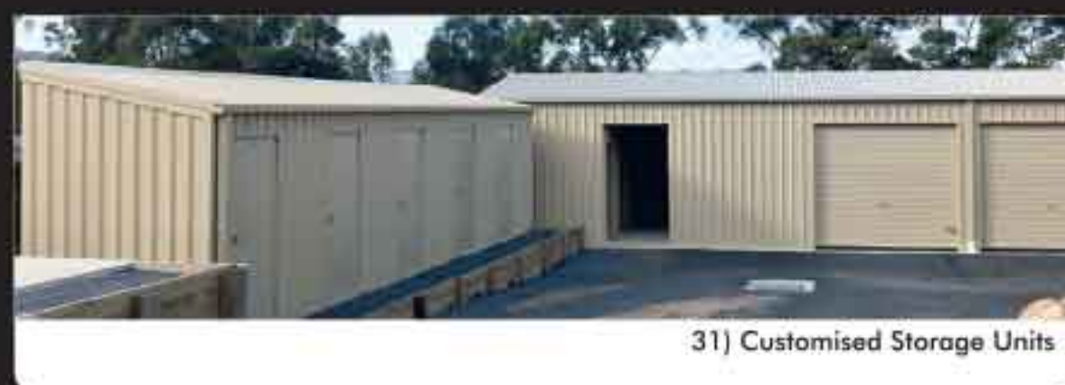
31) Customised Storage Units