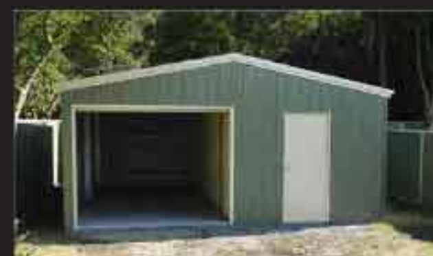
88) Double Garage with Internal Wall