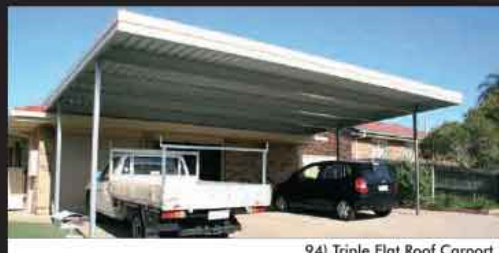
94) Triple Flat Roof Carport