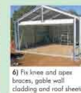
6) Fix knee and apex braces, gable wall cladding and roof sheeting