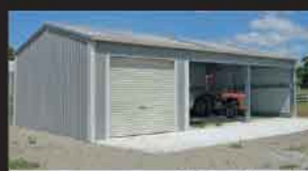
21) Farm Shed with Two Open & One Enclosed Bay