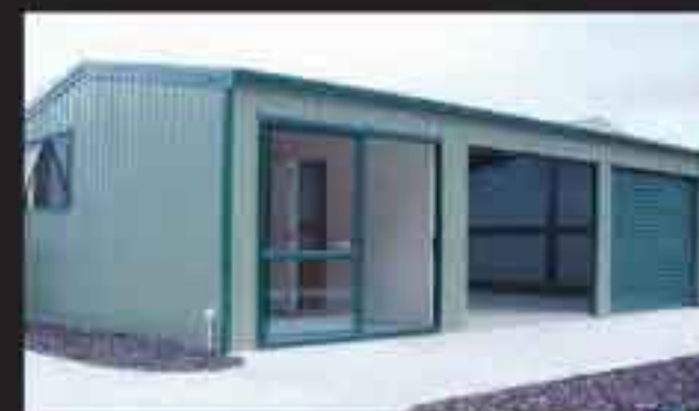
82) Double Garage & Office