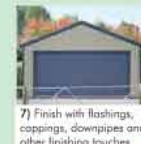
7) Finish with flashings, cappings, downpipes and other finishing touches