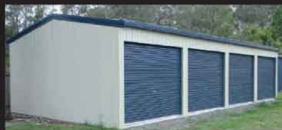
75) Multiple Car Garage

Genuine COLORSTEEL® cladding reassures you that your investment will look great for years to come. Simple design mixed with detailed instructions and specifications also means that a steel garage can be assembled by an experienced home handyman with a little help. A Fair Dinkum garage is the perfect addition to any New Zealand home.