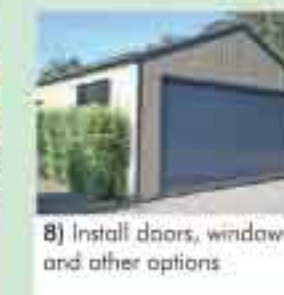
8) Install doors, windows and other options