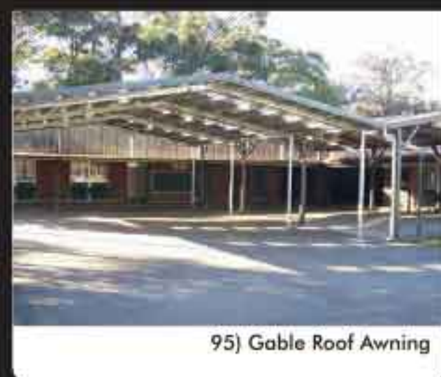
95) Gable Roof Awning