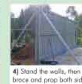
4) Stand the walls, then brace and prop both sides