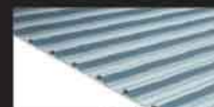
Metalcraft Metrib 760mm Cover