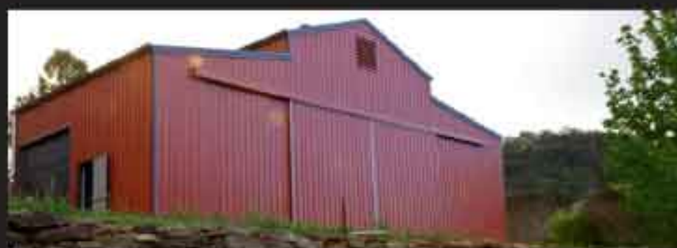
45) American Barn with Sliding Doors & Side Access