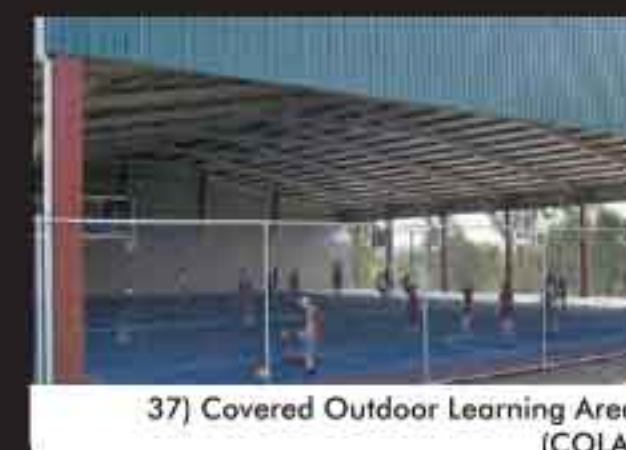
37) Covered Outdoor Learning Area (COLA)