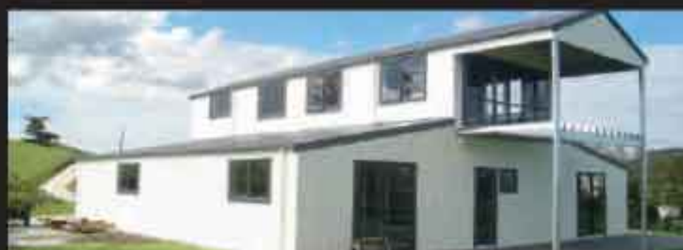
41) American Barn with Covered Deck