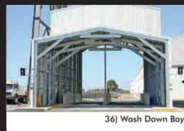
36) Wash Down Bay