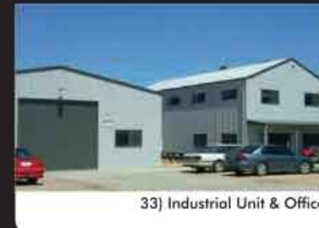
33) Industrial Unit & Office