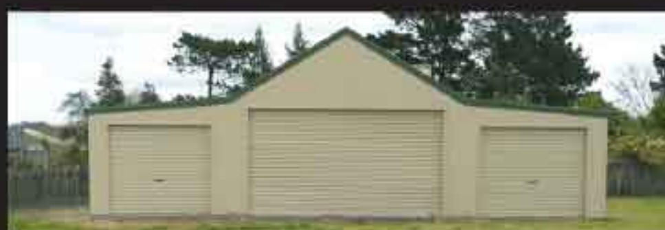
47) Kiwi Barn with Three Roller Doors