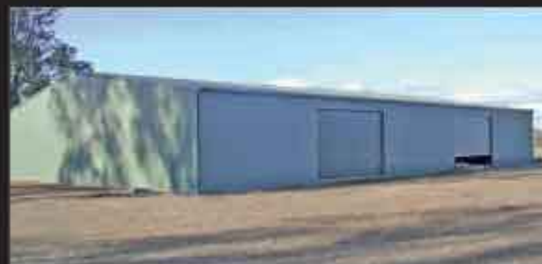
2) Large Machinery Shed