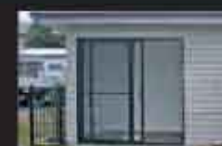
Glass Sliding Door

These can be fitted in all shapes and sizes of sheds, garages, barns, stables or whatever steel building you have. Some can make your workshop or storage shed more secure or allow ventilation or energy efficiency.