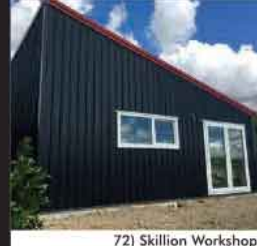
72) Skillion Workshop