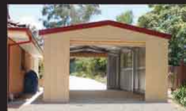
89) Single Garage with Roller Doors Front & Rear