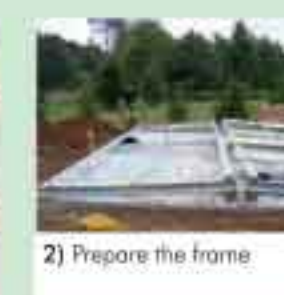
2) Prepare the frame