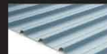
Metalcraft T-Rib 760mm Cover