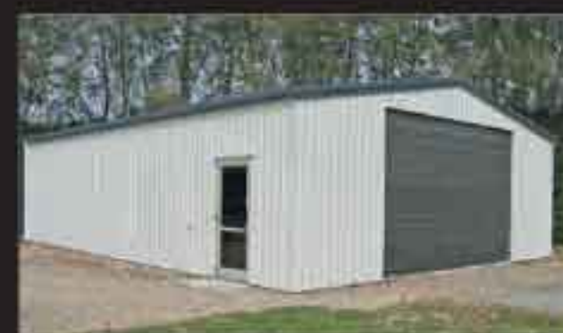
84) Large Single Garage