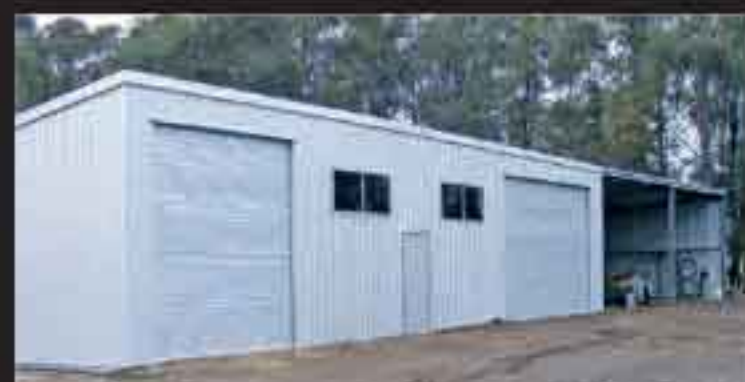
6) Custom Monopitch Farm Shed with Open Bays & Large Doors