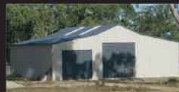
50) Kiwi Barn with Two Roller Doors