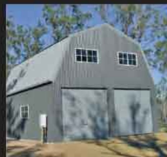
63) Quaker Barn with Double Roller Door