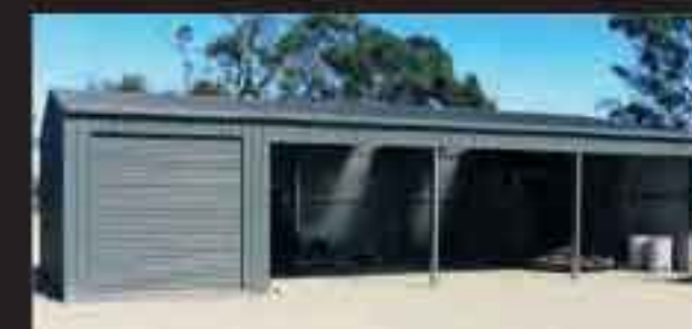
20) Open Farm Shed with One Enclosed Bay