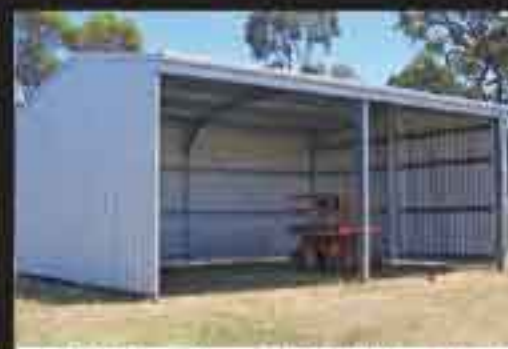
10) Open Front & Side Hay Shed