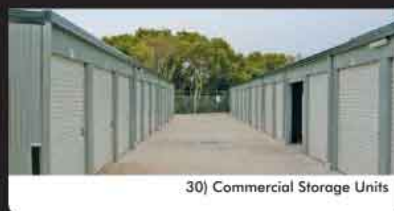
30) Commercial Storage Units