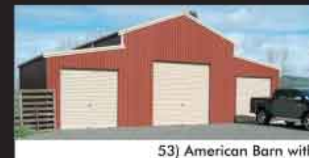
53) American Barn with Three Roller Doors