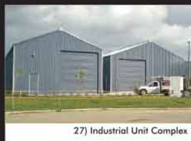
27) Industrial Unit Complex