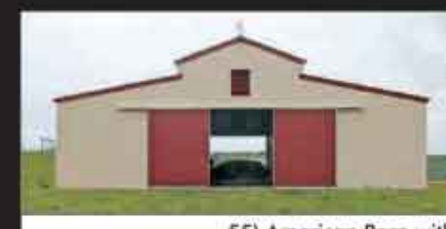
55) American Barn with Sliding Doors