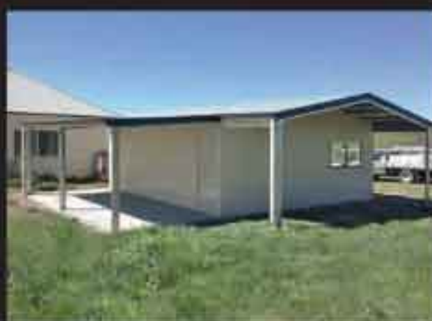
91) Garage with Garaport & Lean-to