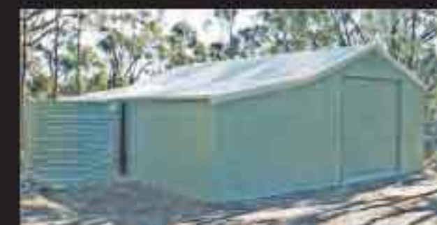
51) Split Kiwi Barn