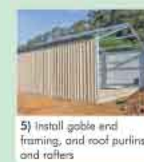
5) Install gable end framing, and roof purlins and rafters