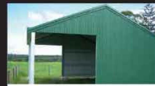
16) Open Front & Side Hay Shed