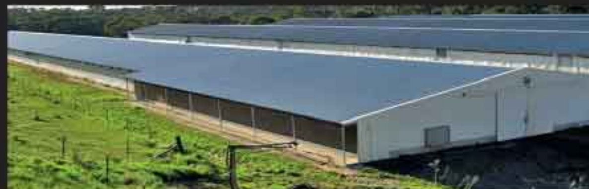
1) Large Farming Barn

All of our buildings are designed with the rugged New Zealand conditions in mind and with over 180,000 buildings already built around Australasia, you can rely on our capabilities.