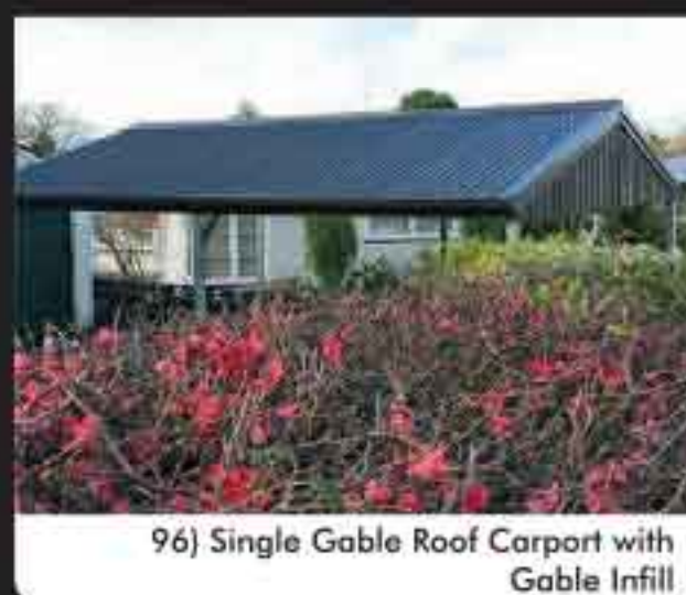
96) Single Gable Roof Carport with Gable Infill