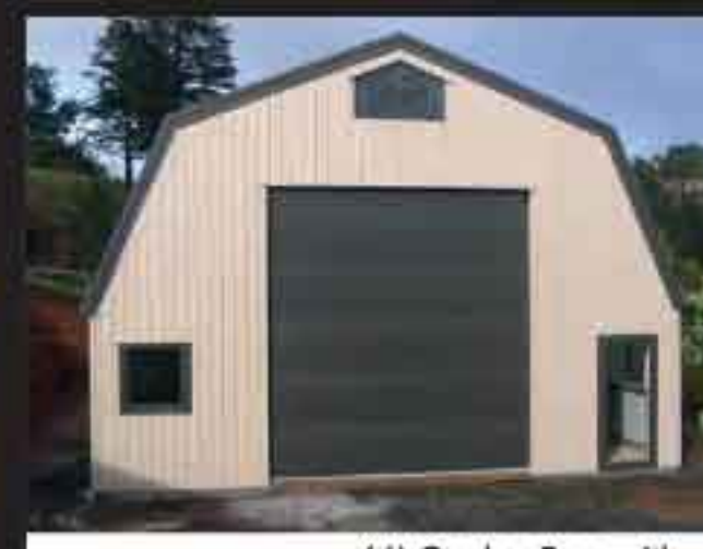
66) Quaker Barn with Large Roller door