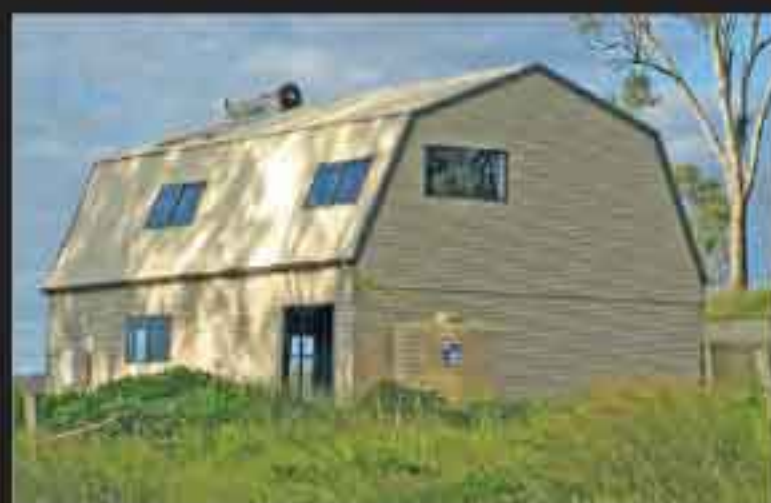
61) Quaker Barn with Horizontal Cladding