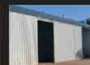
Steel Sliding Doors