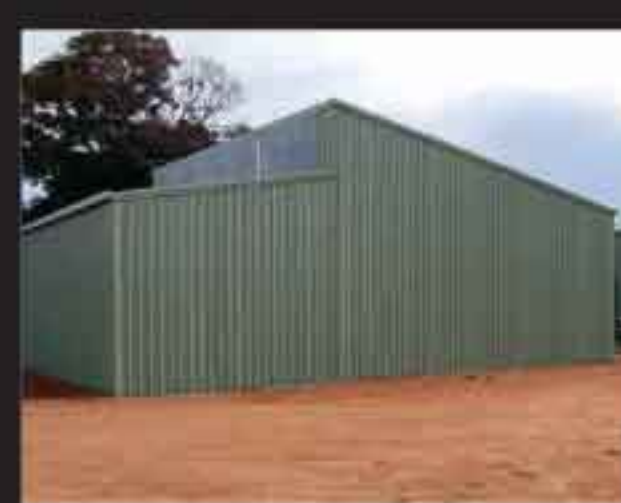
69) Skillion Garage with Lean-to