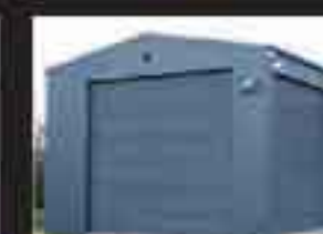
Additional Roller Doors