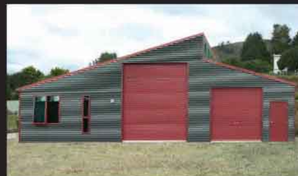
67) Skillion Roof Double Garage with Lean-to