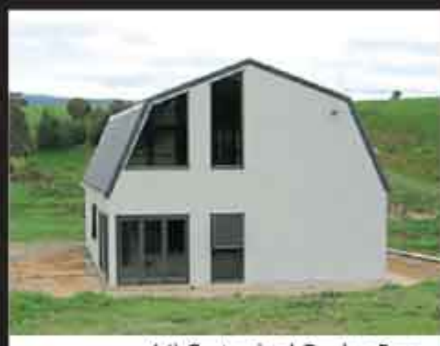
64) Customised Quaker Barn