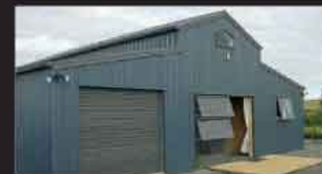
49) American Barn with Reception