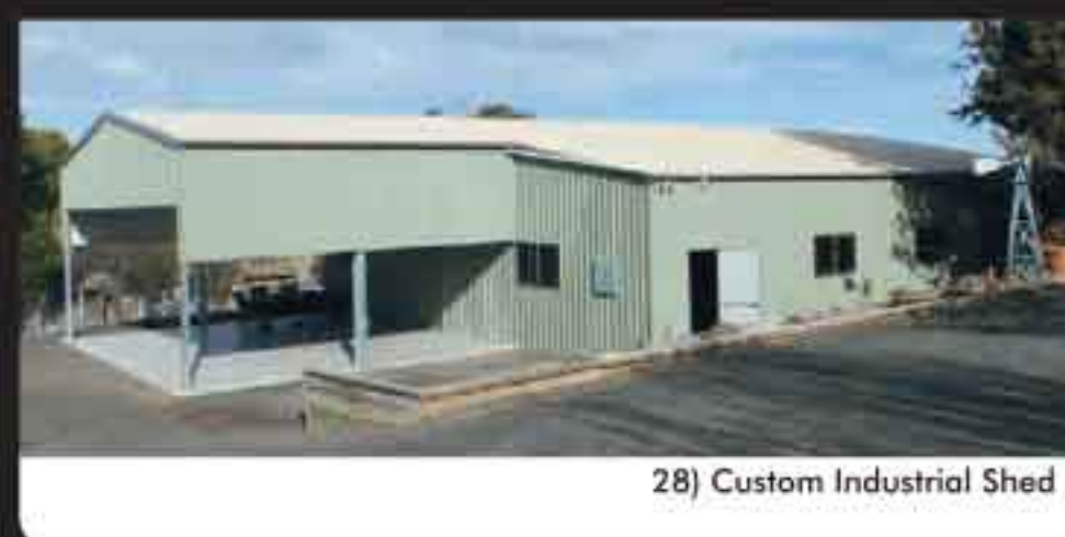
28) Custom Industrial Shed