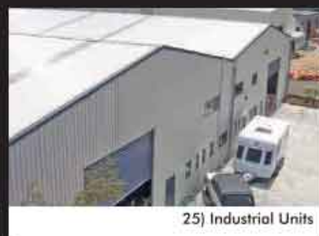
25) Industrial Units