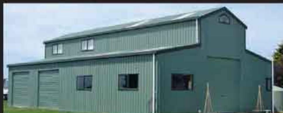
43) American Barn workshop and Garaging