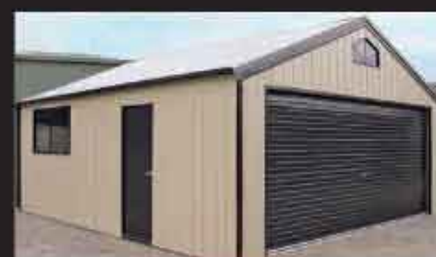
86) Double Deluxe Garage