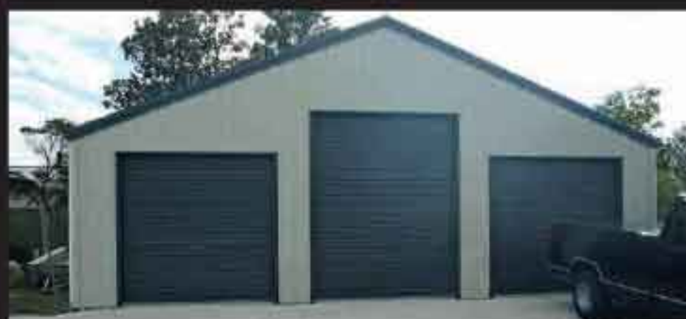
78) Triple Garage