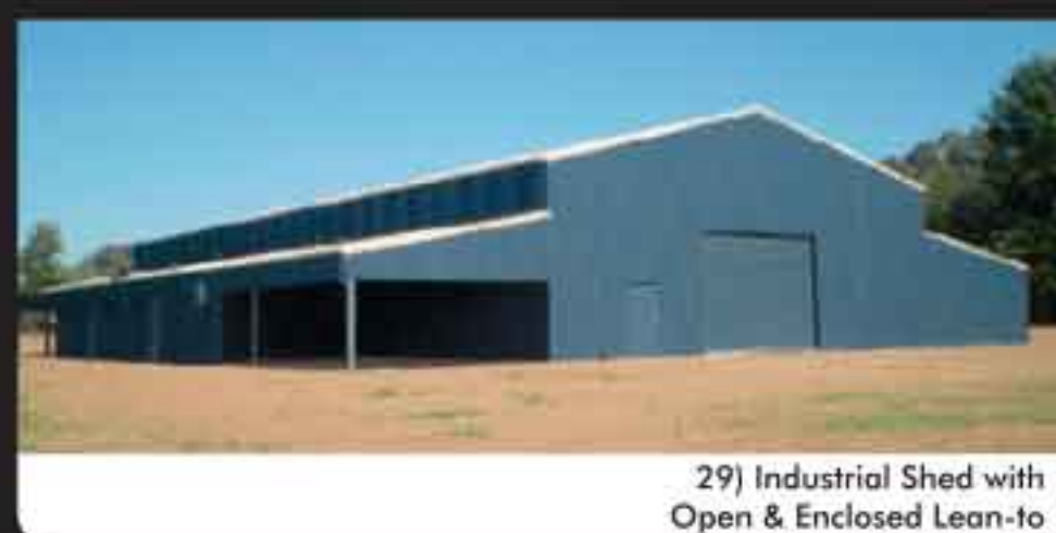
29) Industrial Shed with Open & Enclosed Lean-to