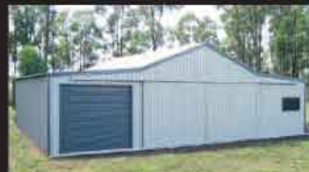
13) Sliding Doors