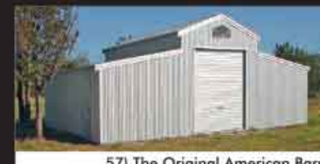
57) The Original American Barn