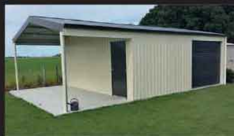
92) Garage with Garaport