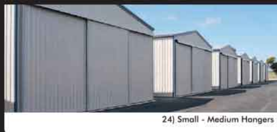
24) Small - Medium Hangers