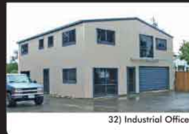
32) Industrial Office