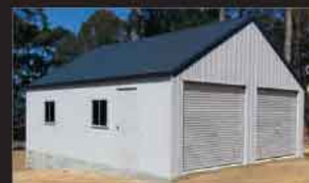
85) Double Garage with 30° Roof Pitch