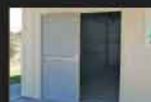
Personal Access Doors