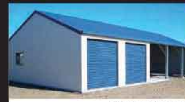
18) Farm Shed with Three Open & Two Enclosed Bays