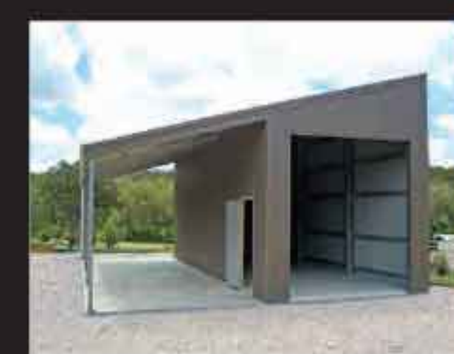
71) Oversized Industrial Skillion with Lean-to