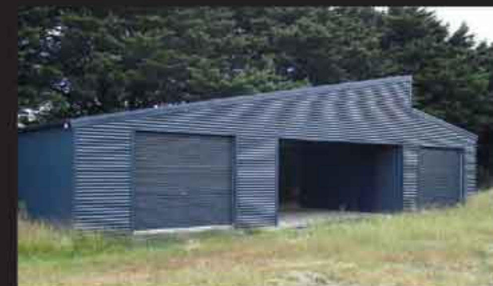
68) Horizontally Clad Skillion Barn with Internal Wall