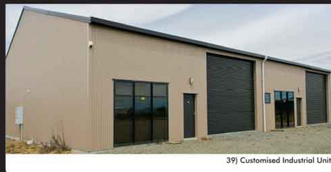
39) Customised Industrial Units